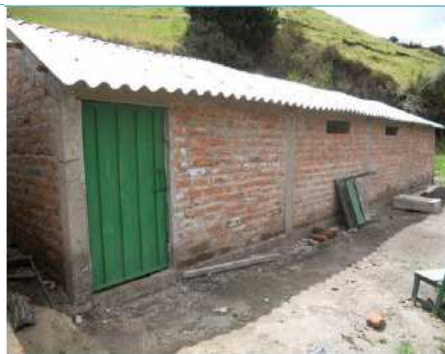
Nearing completion, this photo shows the exterior of the "cuyera", the building used for the breeding of cuy (guinea pigs)