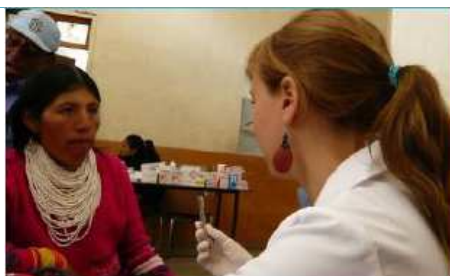
Medical and prevention activities continued in 2010 in several indigenous villages in the Canton Colta, Chimborazo