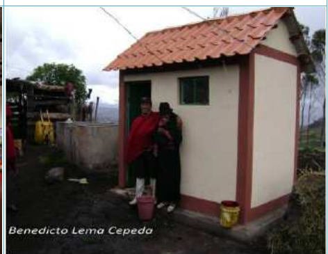
One of the 27 family bathrooms built in the village of Cochaloma, Canton Colta