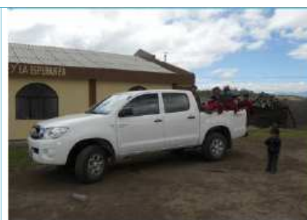
Our new vehicle purchased in the month of August 2010

Everything else has gone entirely to our projects, as indicated in this report.