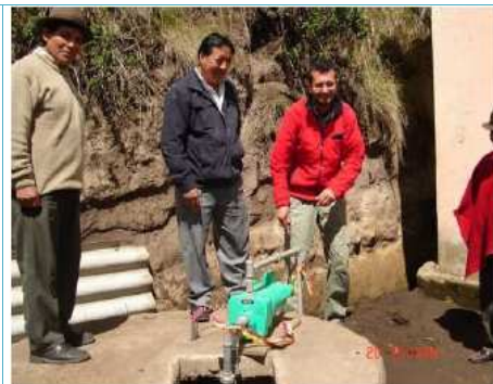
A pump to provide water to the school of Pulucate, delivered in May 2010