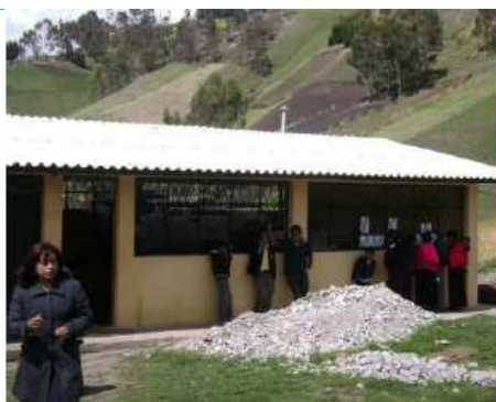
The classroom of Gahujón completed in May 2010. Inside, the staff room and the secretary room