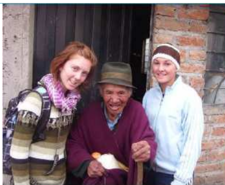
The elders of Esperanza and Cochaloma were visited by our volunteers