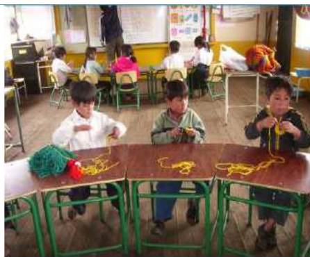
Craft classes in schools