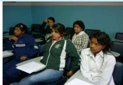
On the 10 th of December 2010 a sexual education workshop was held with the young people from the orphanage