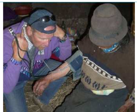
The elderly were visited by the doctor directly in their huts