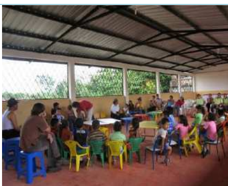
A view of the interior of the new hall built in the village of Nueva Union