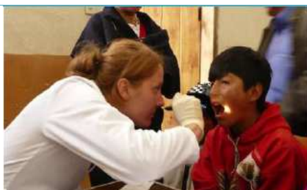
The presence of volunteer doctors and medical students is always appreciated by the local population