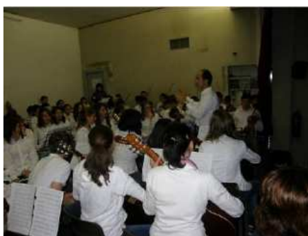
The orchestra "Martino Anzi" of Bormio with its 70 musicians from secondary school