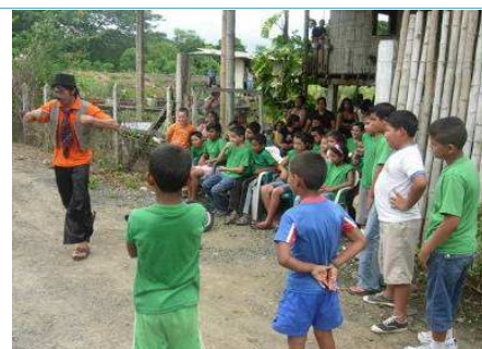
One of leisure activities to entertain the kids in our Guagua program, May 2010

In the first months of 2011 it will be possible to receive correspondence via Internet: on our website an area reserved to the supporters will be soon activated in which they will be able to see all the information about the child. The godfathers that will choose to benefit from this new method will also relief us from some office work as well as allowing for a reduction in costs.