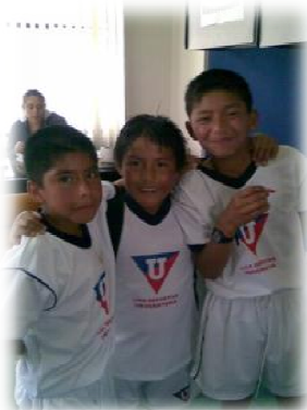
Kids attending a soccer course