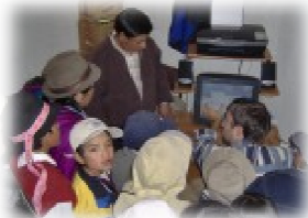
Delivery of a computer in Reten