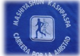
Second edition of the race for the friendship mountains