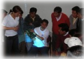
Computer course in Riobamba, many schools were covered by our project