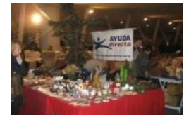
Christmas Market 2008 at the Pentagon in Bormio