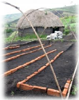
The construction of a small nursery for planting native trees