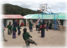
Opening the new basketball court in La Esperanza