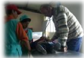
Moments of the medical brigade in towns of Chimborazo