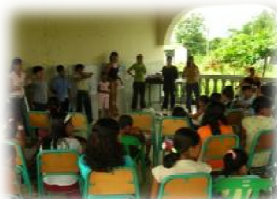
Moments in an art workshop with recycled materials in Esmeraldas