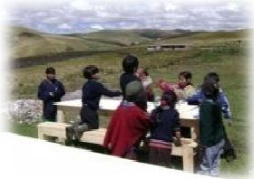
Deliver of dining tables in Toropamba