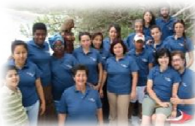
Volunteers in Guagua Convention