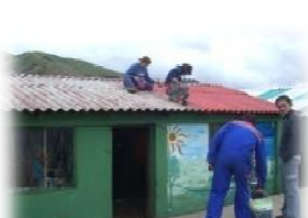
Maintenance work in the school kitchen in la Esperanza

Project Esperanza was launched in 2002, aimed at constantly improving the living conditions of the population living in the indigenous Kichwa community of La Esperanza. The program has currently expanded to six other villages in Colta in the Province of Chimborazo, which is considered the poorest area of Ecuador, lacking basic services like clean water, good education and access to healthcare.