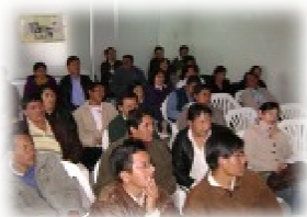
Principals of secondary schools gathered of the presentation of the draft improving food project