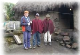
House visit to a patient